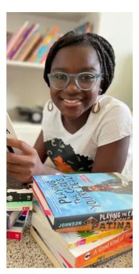
278 likes • 137 shares

Reading books from a variety of perspectives, including those of traditionally (50a) <u>marginalized</u> voices, is critical to preserving and strengthening an inclusive and vibrant nation. People like Scott are not only preserving students' right to freely choose what they read, but they're also inspiring others to fight for intellectual freedom, the freedom of expression and a society that honors diversity and representation.