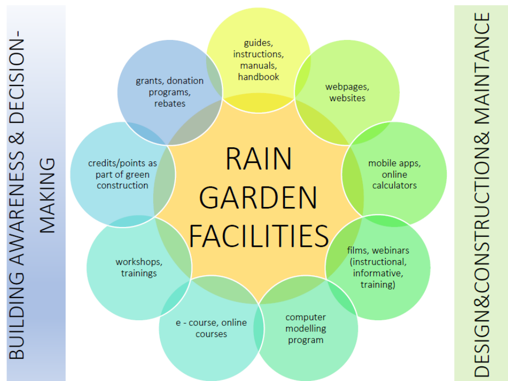
Figure 3. The classification of facilitations of the rain garden application in a city, depending on the implementation stage of the solution.

Figure 3 summarizes the currently available amenities used to introduce rain gardens into the urban fabric, when building awareness in a society and in the decision-making process, as well as the stages involving the design, implementation, and maintenance of these LID practices.