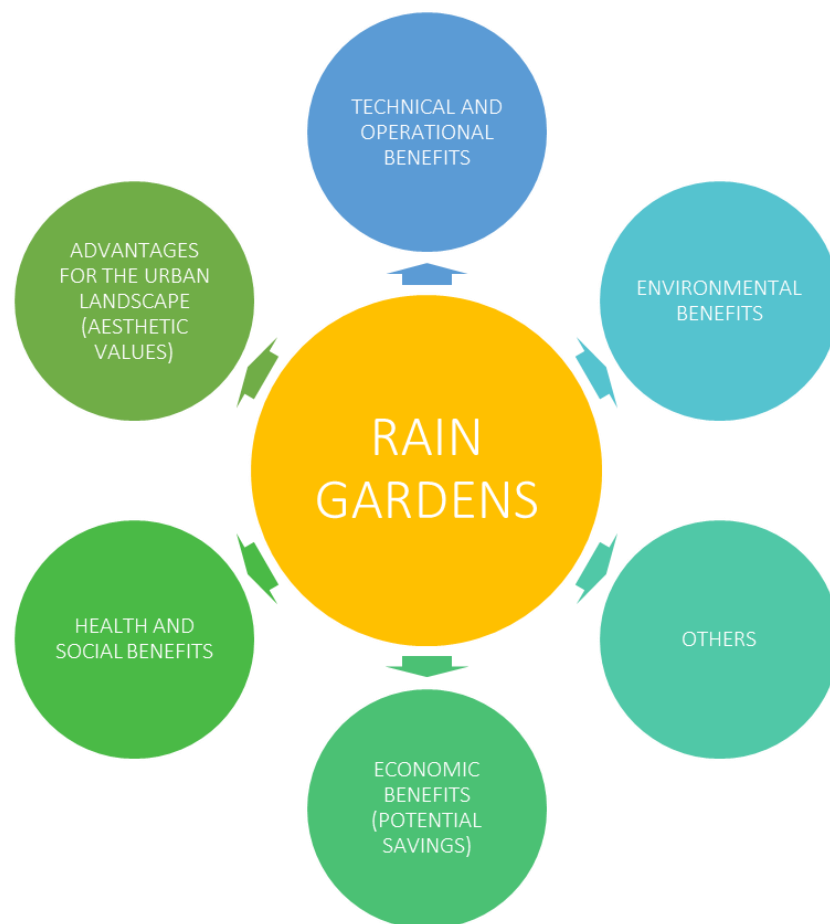
Figure 1. Holistic approach to the advantages of using rain gardens in an urban space—the main types of benefits.

to this issue. Figure 1 shows a diagram that illustrates the comprehensive approach to the benefits of implementing rain gardens in a city. A similar approach to profits from stormwater infrastructure was adopted in one of the tools of the American Environmental Protection Agency [25]. This stormwater online tool (named CLASIC) as part of its output provides information about performance (volume reduction and pollutant load reduction), and assesses the value of co-benefits, regarding the environmental, social, and financial gains [25].