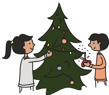
trim the tree