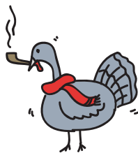
quit cold turkey