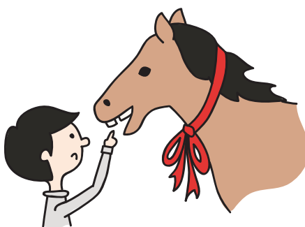
don't look a gift horse in the mouth