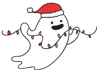
the holiday spirit